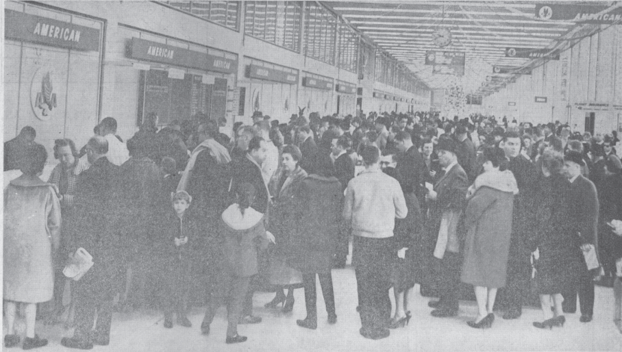
[TRIBUNE Staff Photo]

Pope ignores rug to kneel on bare floor in room where Jesus is believed to have held Last Supper.