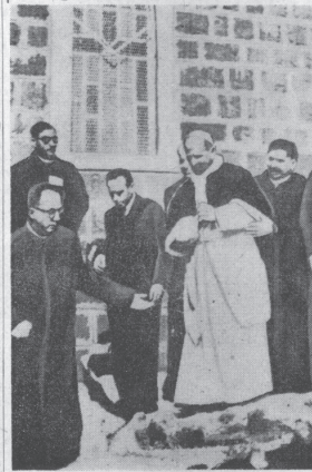
Pope Paul VI being helped down to edge of Sea of Galilee at Tabbgha, Israel, where Christ made Peter his chief apostle and fed the multitude with loaves and fishes. In background is Sanctuary of the Primacy of Peter.