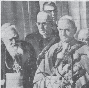
By Cable from Tel Aviv.

President Zalman Shazar (right) of Israel reading message of welcome to Pope Paul VI in Israeli town of Megiddo as pontiff waits behind microphones to give his response.