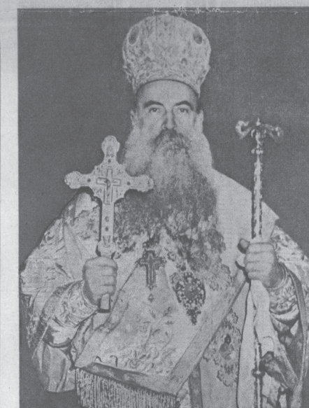
Pope Paul VI (top), spiritual leader of the world's Roman Catholics, and Patriarch Athenagoras, head of Eastern Orthodox Church, who met for talks yesterday in Jerusalem.